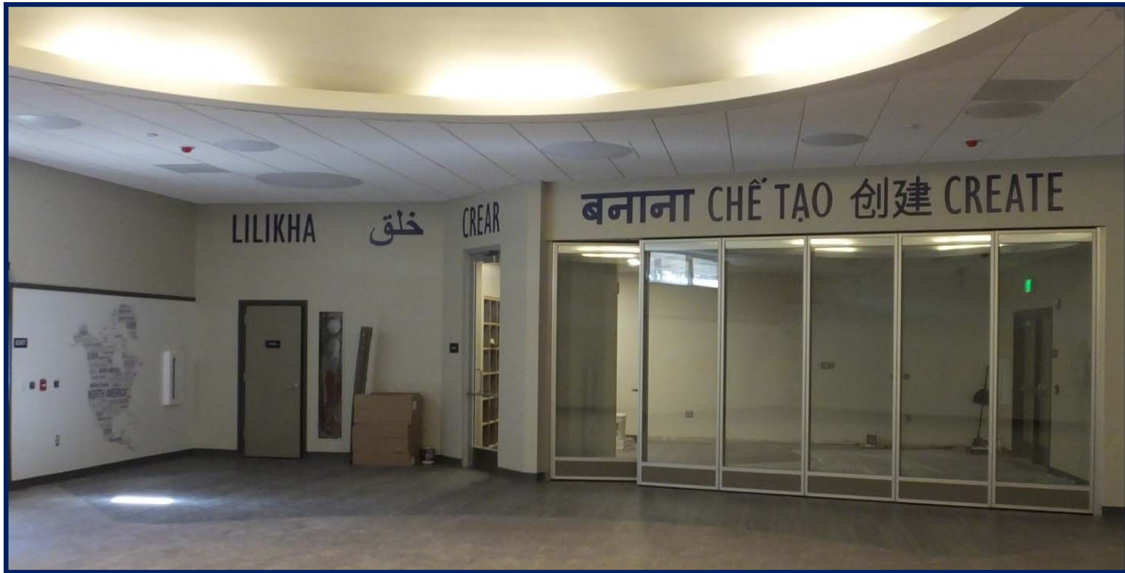
Piedmont - FIS