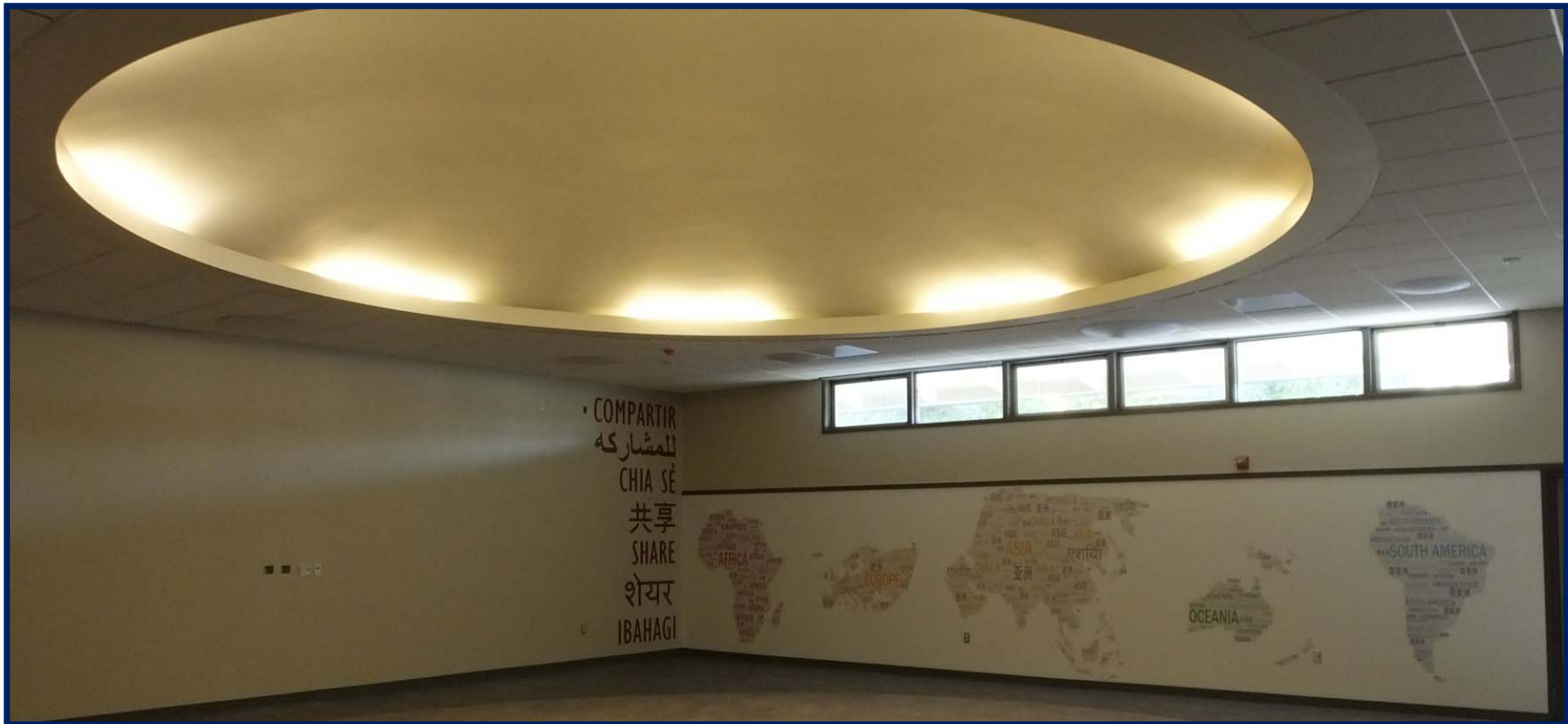
Piedmont - FIS