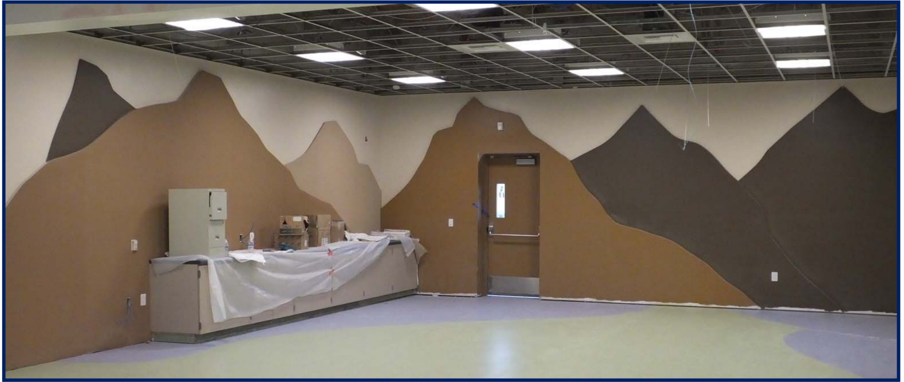
Brooktree – FIS