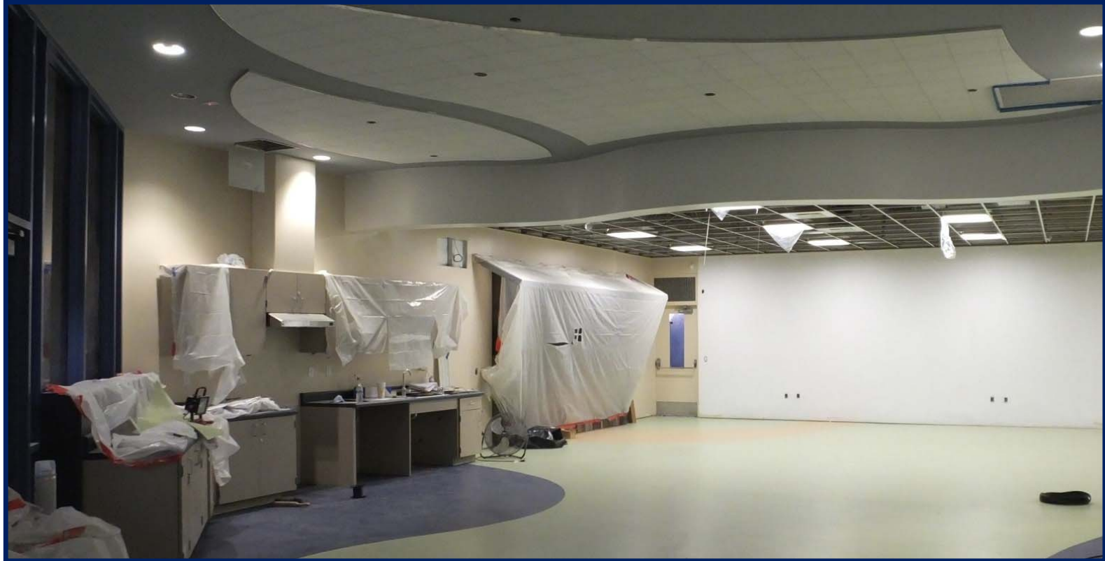
Brooktree – FIS