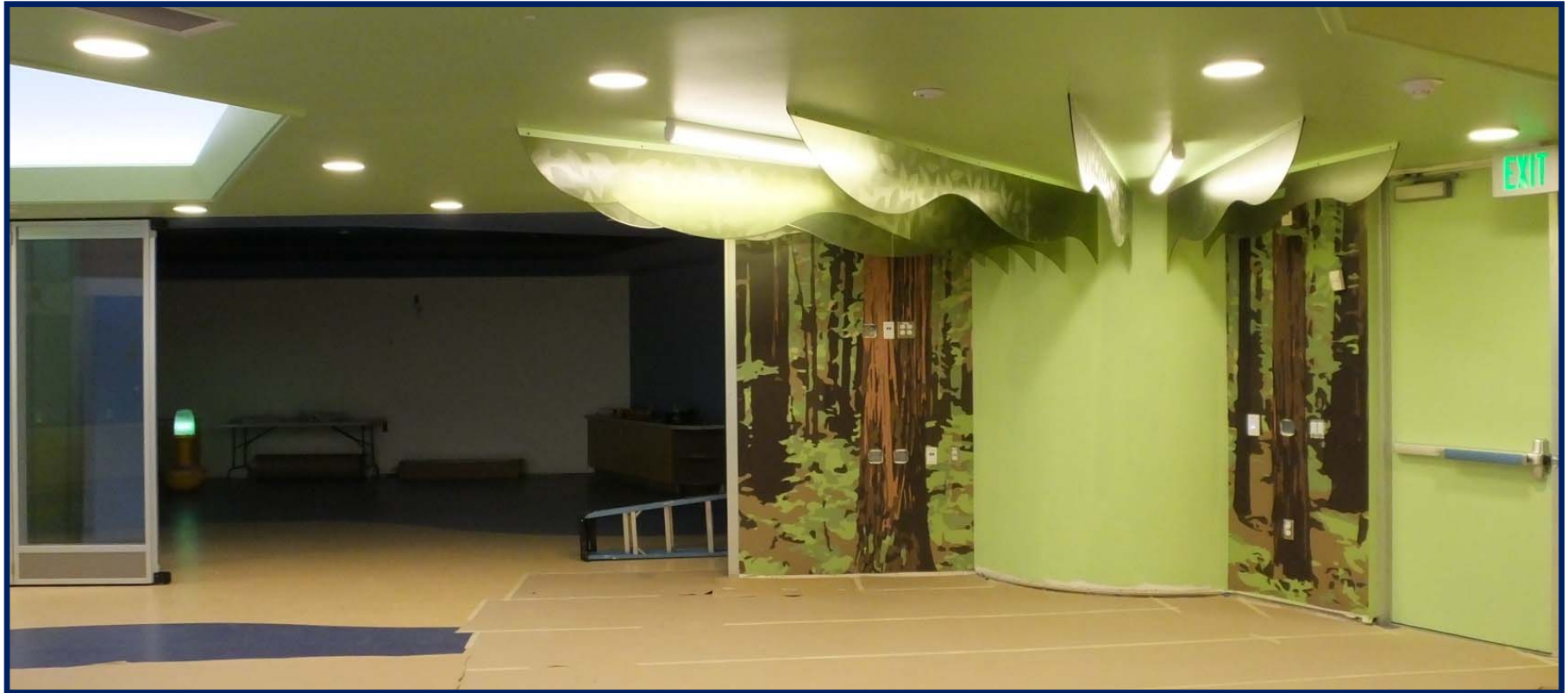
Ruskin - FIS