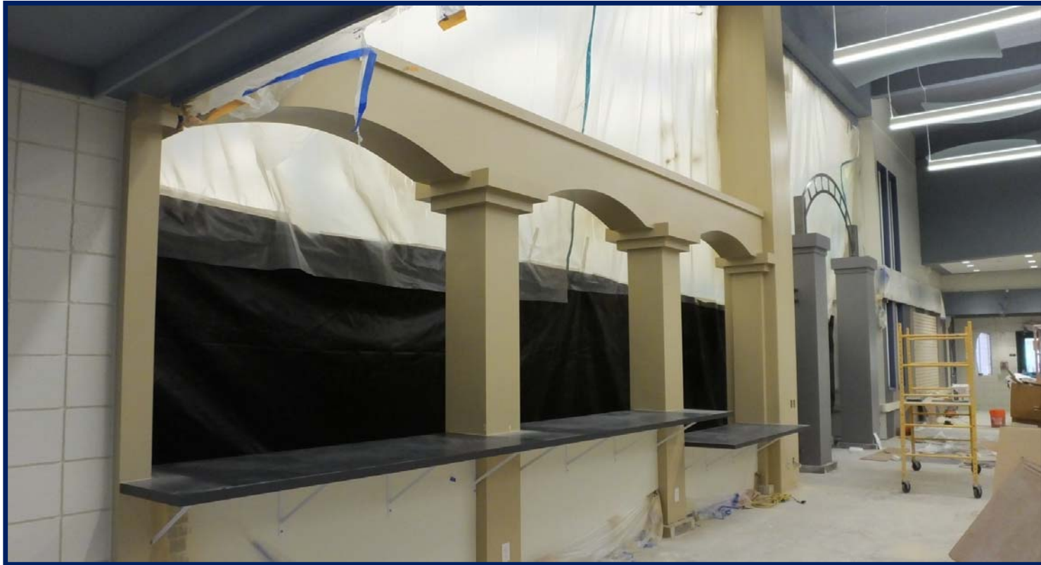
Morrill - FIS